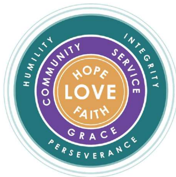
Image: Northside Christian College Core Values